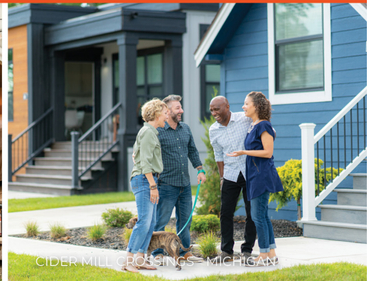
CIDER MILL CROSSINGS - MICHIGAN