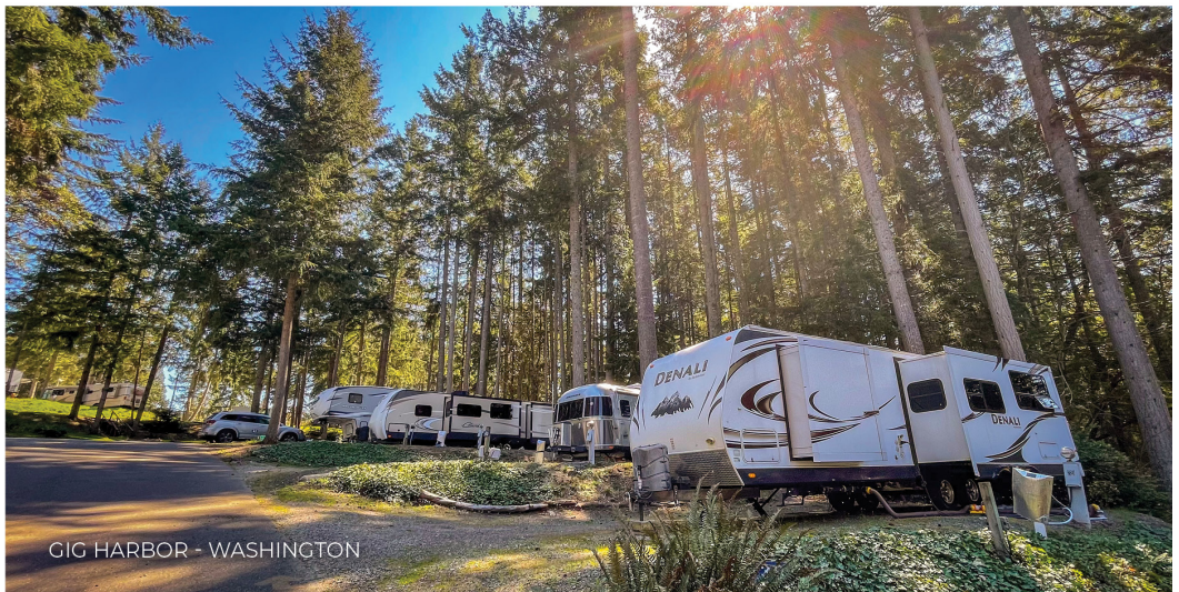
GIG HARBOR - WASHINGTON