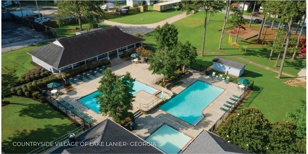
COUNTRYSIDE VILLAGE OF LAKE LANIER- GEORGIA