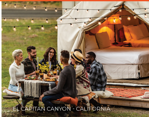
EL CAPITAN CANYON - CALIFORNIA