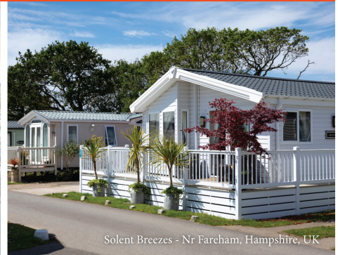
Solent Breezes - Nr Fareham, Hampshire, UK