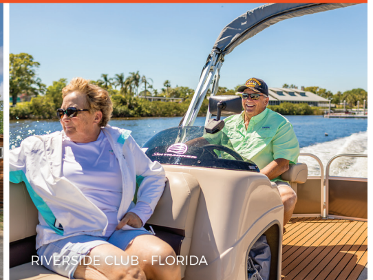
RIVERSIDE CLUB - FLORIDA