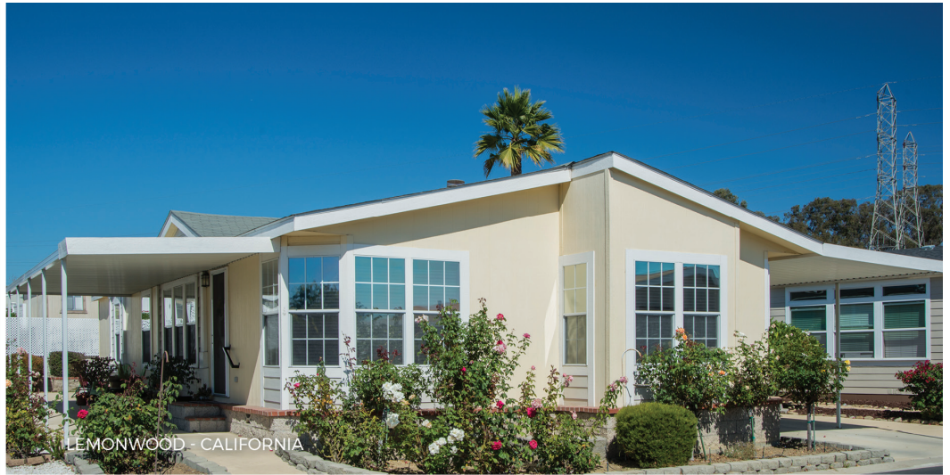
LEMONWOOD - CALIFORNIA