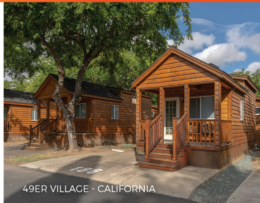
49ER VILLAGE - CALIFORNIA