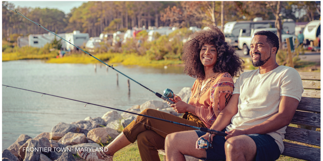
FRONTIER TOWN - MARYLAND