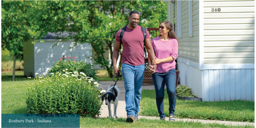
Roxbury Park - Indiana