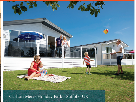
Carlton Meres Holiday Park - Suffolk, UK