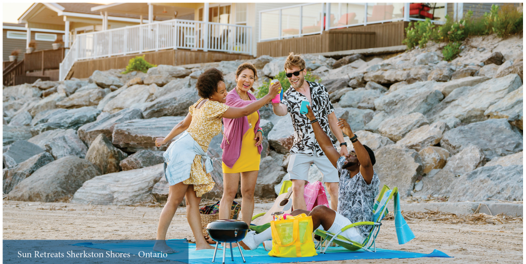
Sun Retreats Sherkston Shores - Ontario