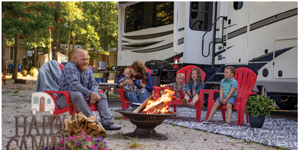
Sun Retreats Sea Isle - New Jersey