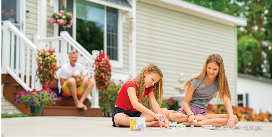
Shelby Forest - Michigan