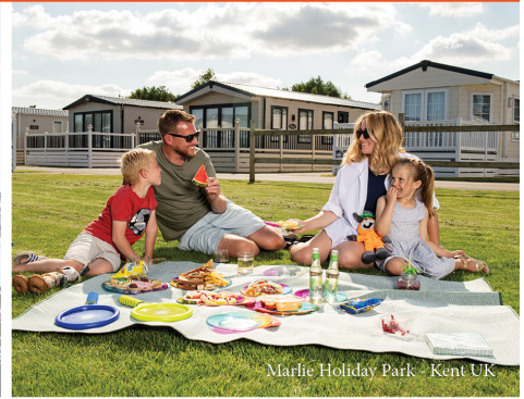
Marlie Holiday Park - Kent UK