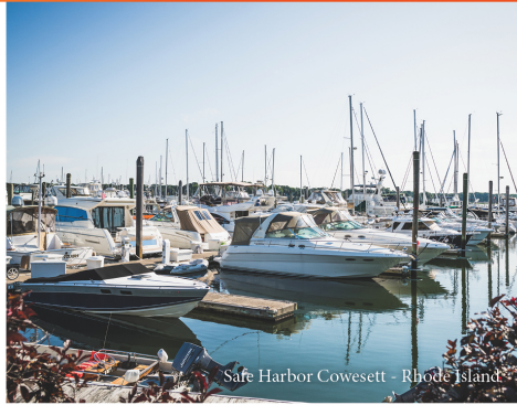
Safe Harbor Cowesett - Rhode Island