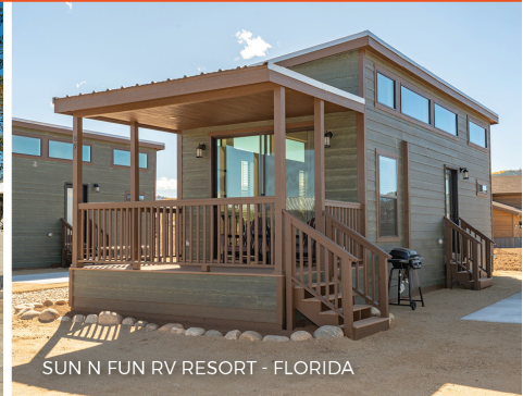
SUN N FUN RV RESORT - FLORIDA