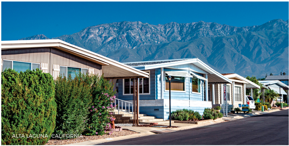
ALTA LAGUNA - CALIFORNIA