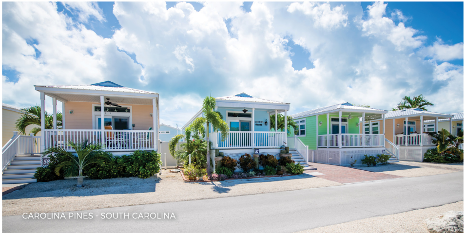
CAROLINA PINES - SOUTH CAROLINA