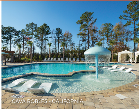
CAVA ROBLES - CALIFORNIA