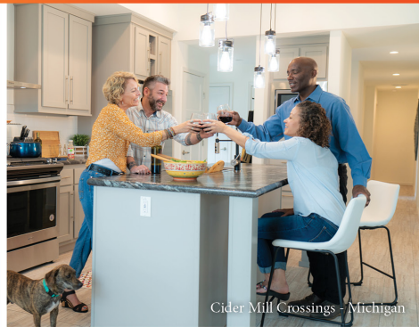
Cider Mill Crossings - Michigan