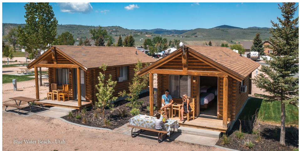
Blue Water Beach - Utah