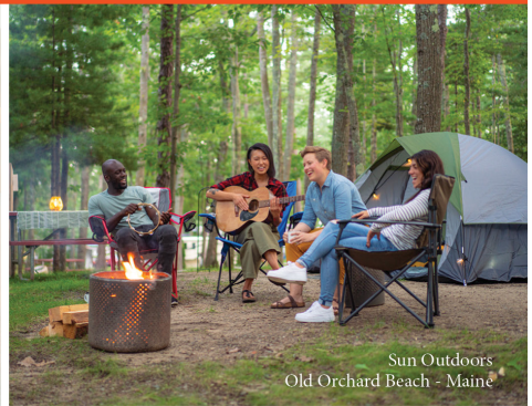
Sun Outdoors Old Orchard Beach - Maine