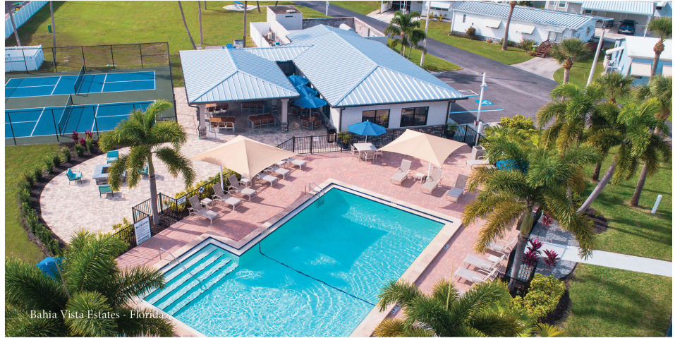
Bahia Vista Estates - Florida