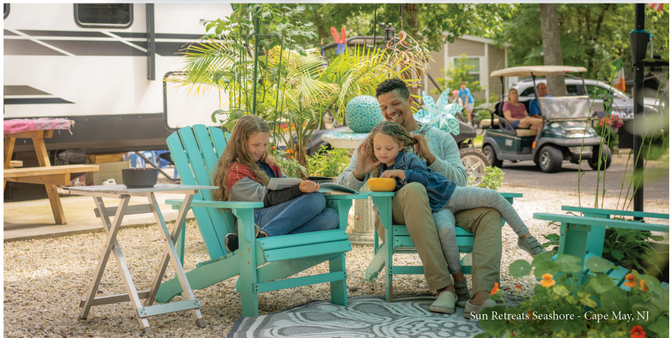
Sun Retreats Seashore - Cape May, NJ