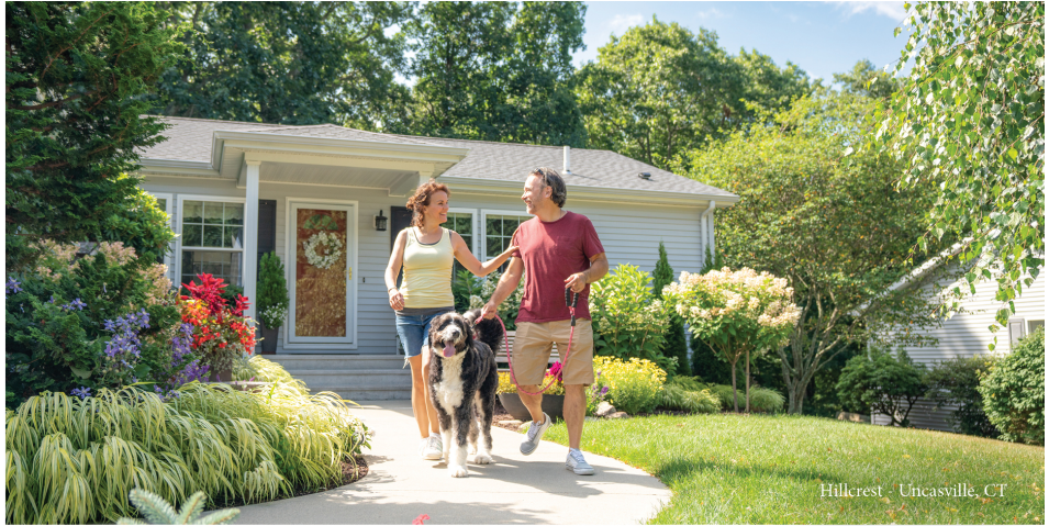
Hillcrest - Uncasville, CT