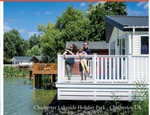
Chichester Lakeside Holiday Park - Chichester, UK