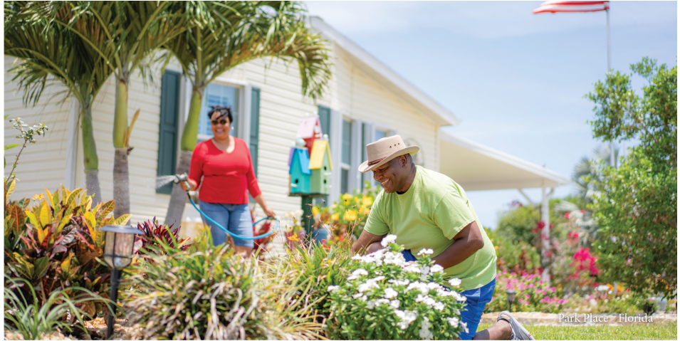
Park Place - Florida