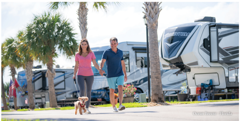
Ocean Breeze - Florida