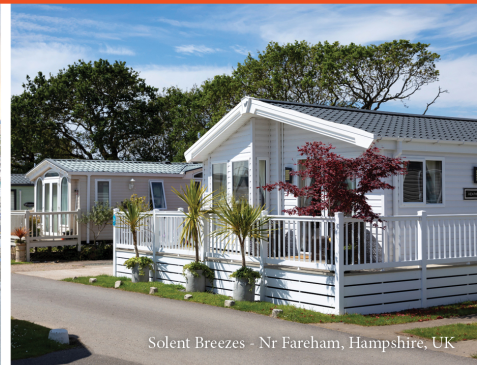
Solent Breezes - Nr Fareham, Hampshire, UK