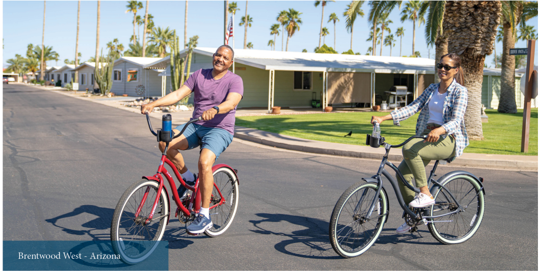
Brentwood West - Arizona