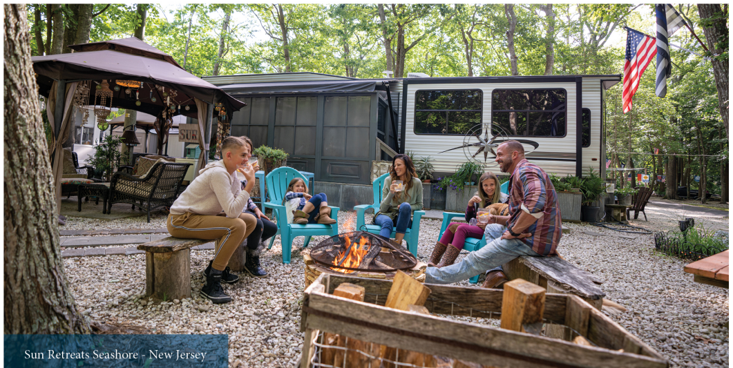
Sun Retreats Seashore - New Jersey