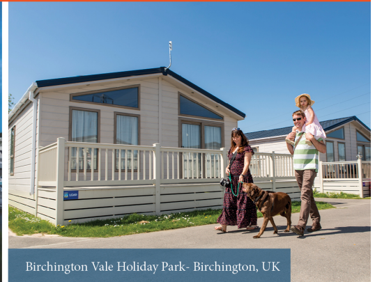
Birchington Vale Holiday Park- Birchington, UK