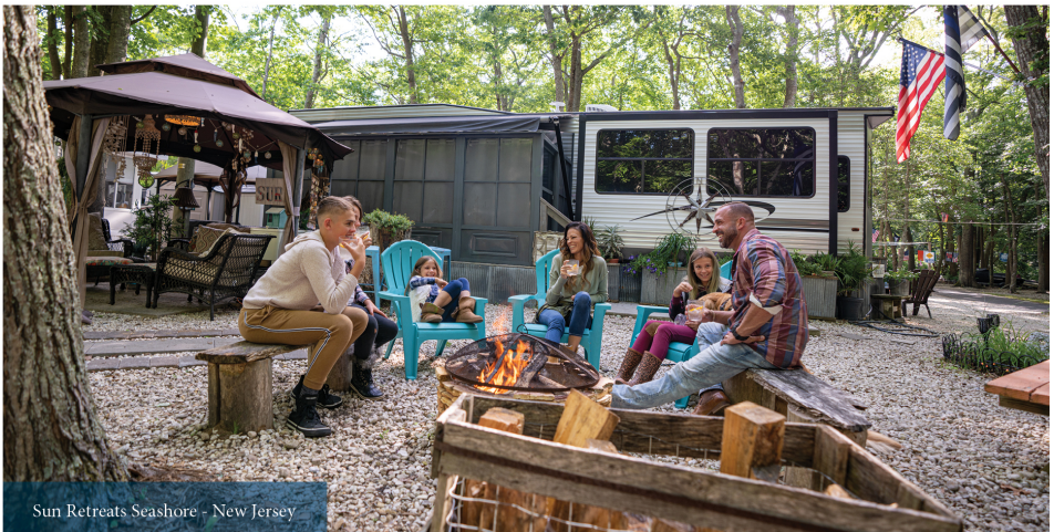
Sun Retreats Seashore - New Jersey